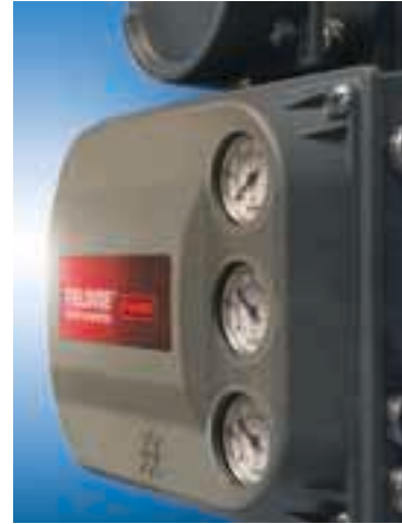
The Digital Valve Controller (DVC) with PD capability captures data from the valve assembly. AMS ValveLink Software displays the results graphically with recommended actions.